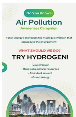
(Confirmed) R-34: Intermediate level