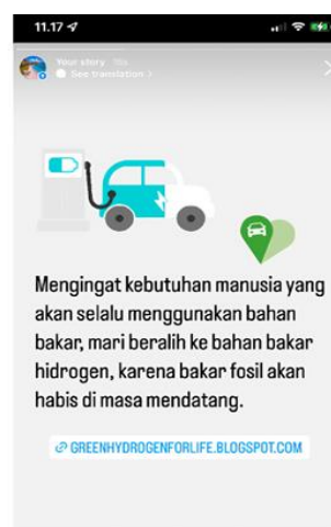
(Confirmed) R-15: Intermediate level